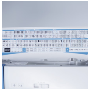
240 Built-in Stitches