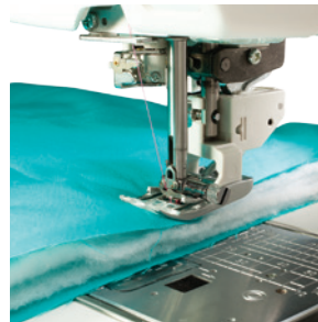
AcuFeed Flex Layered Fabric Feeding System