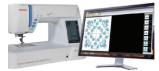
Stitch Composer Stitch Creation Program